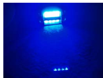
BLUE = HS-51055B