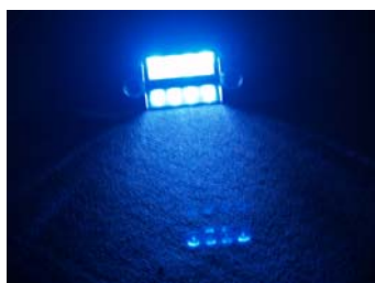
WHITE = HS-51055D