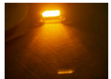
AMBER = HS-51055E