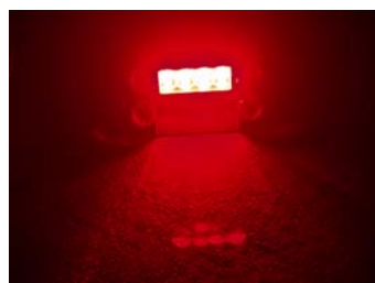
RED = HS-51055A