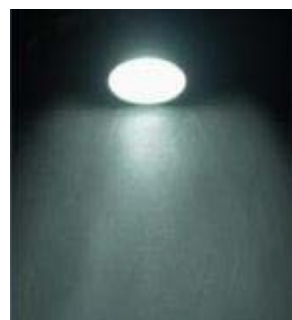
Cool White 6000K