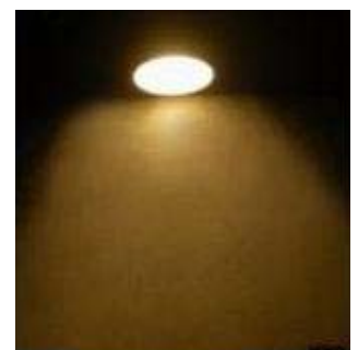
Warm White 3000K